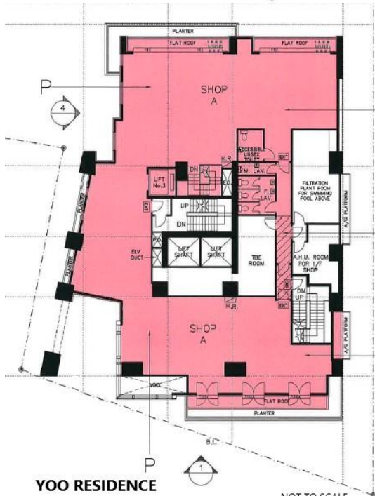
YOO RESIDENCE FIRST FLOOR PLAN NOT TO SCALE FOR REFERENCE ONLY